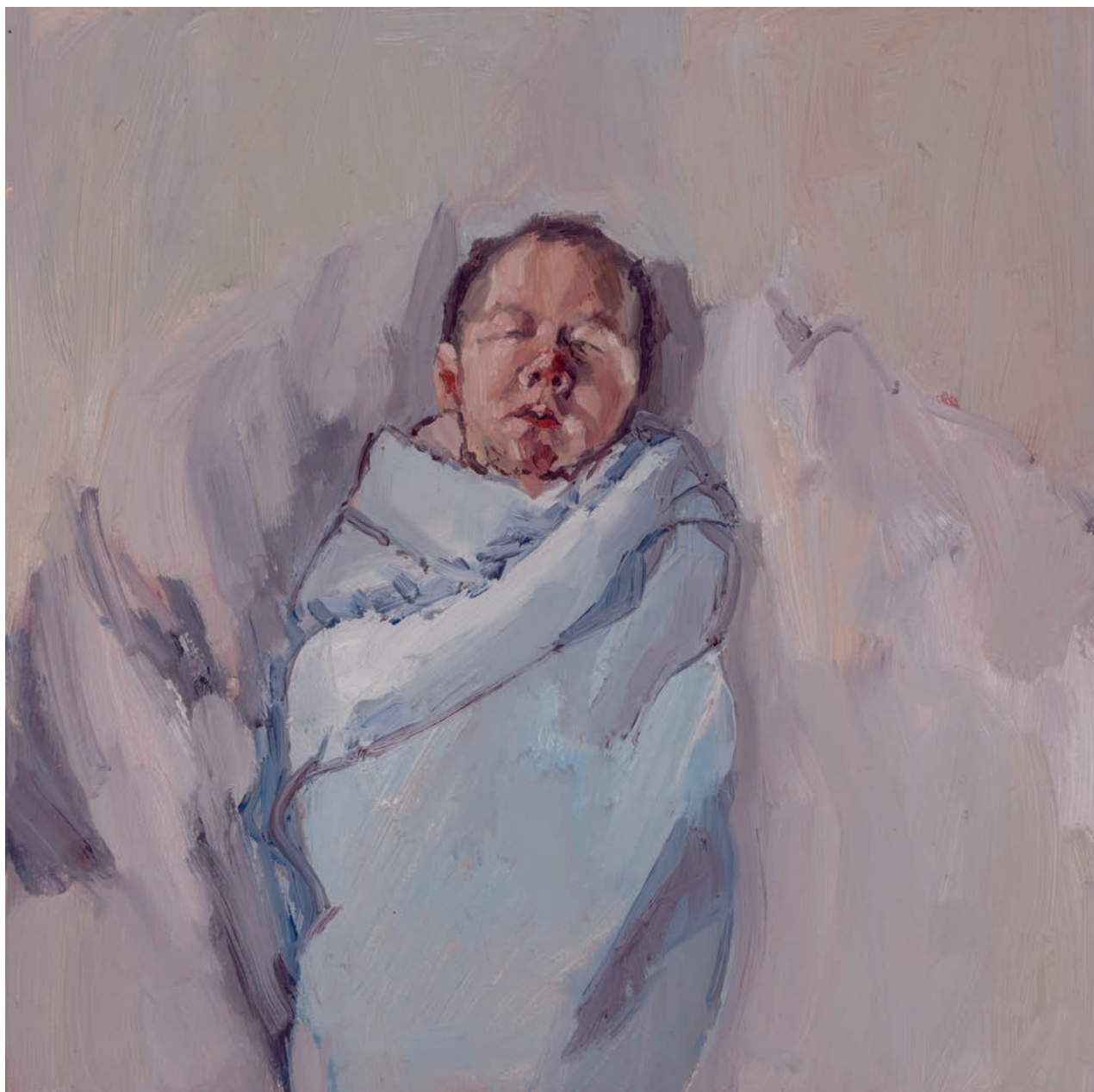
TED SWADDLED IN A BLUE BLANKET. 2021