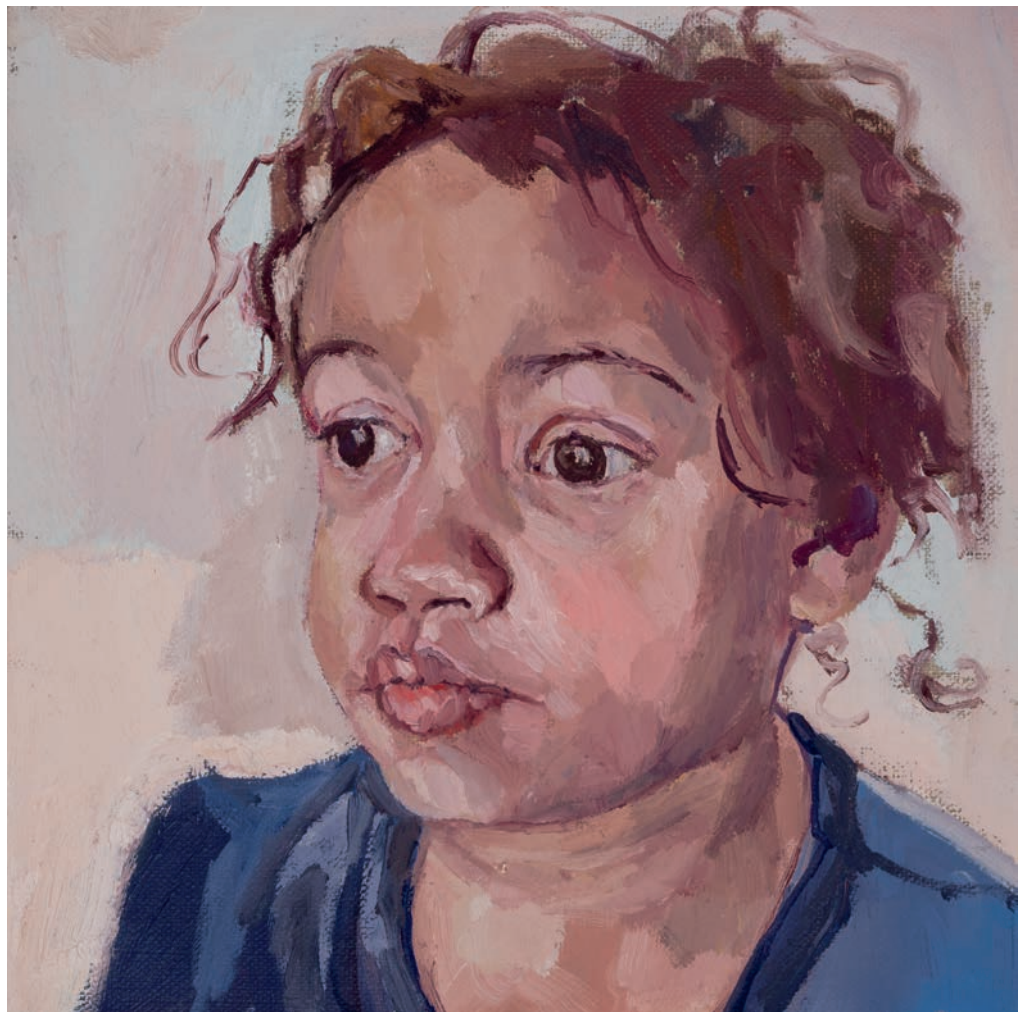
ZANE. 2021 Oil on panel 20 x 20 cm Not For Sale (£500 for a similar commission)

Paintings start at £500 for all work under 30x30cm. This can be paid in instalments or in full, on completion. Paintings above 30x30cm are £800-1200 depending on whether there are multiple figures. Framing is an additional cost.