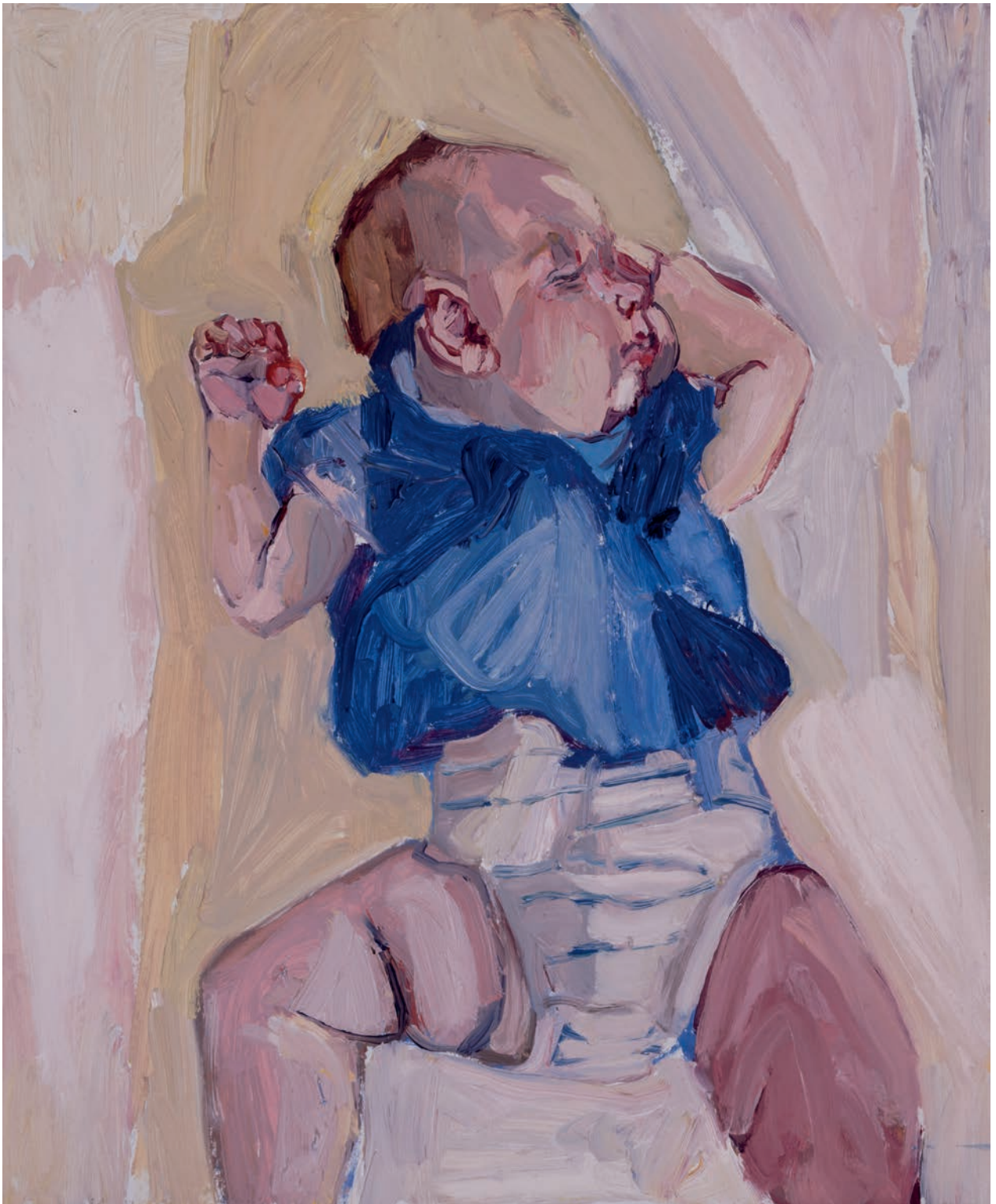
CHUBBY LEGS ON A CHECKED CHAIR, 2021