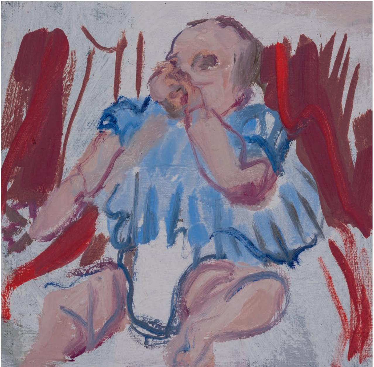
SMART TOGS. 2021 Oil on linen board 20 x 20 cm £590