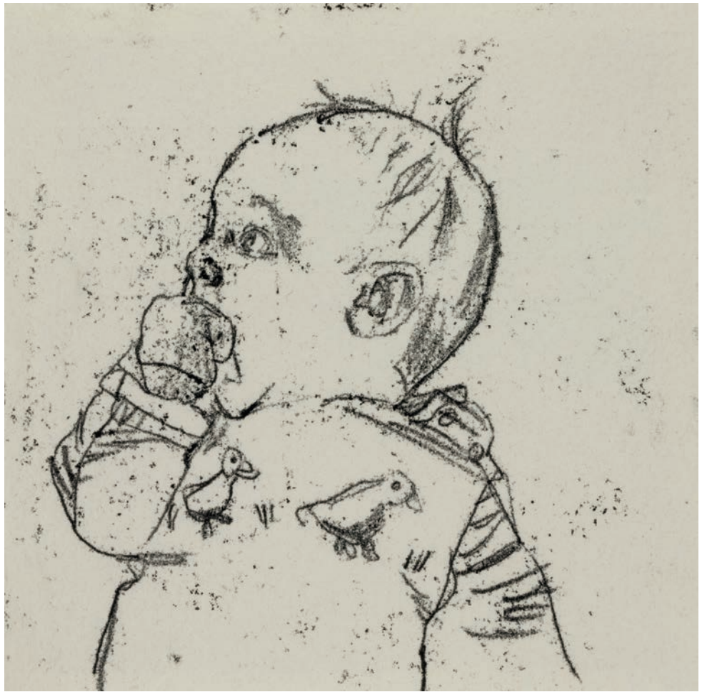
DUCKS. 2022 Mono print 15 x 15 cm £390